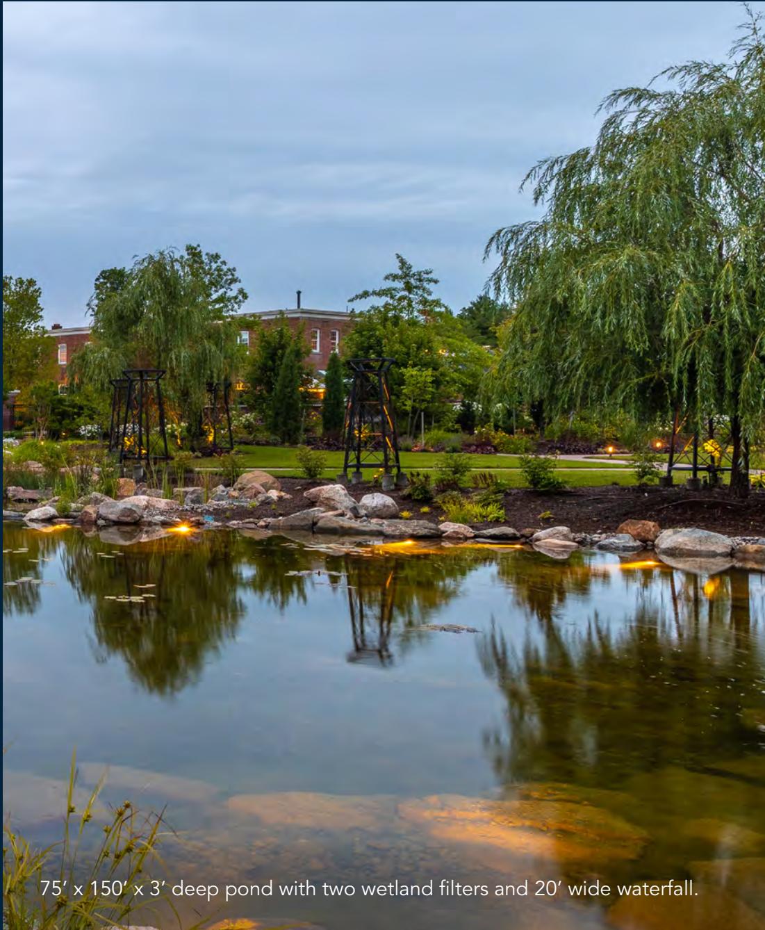
75' x 150' x 3' deep pond with two wetland filters and 20' wide waterfall.