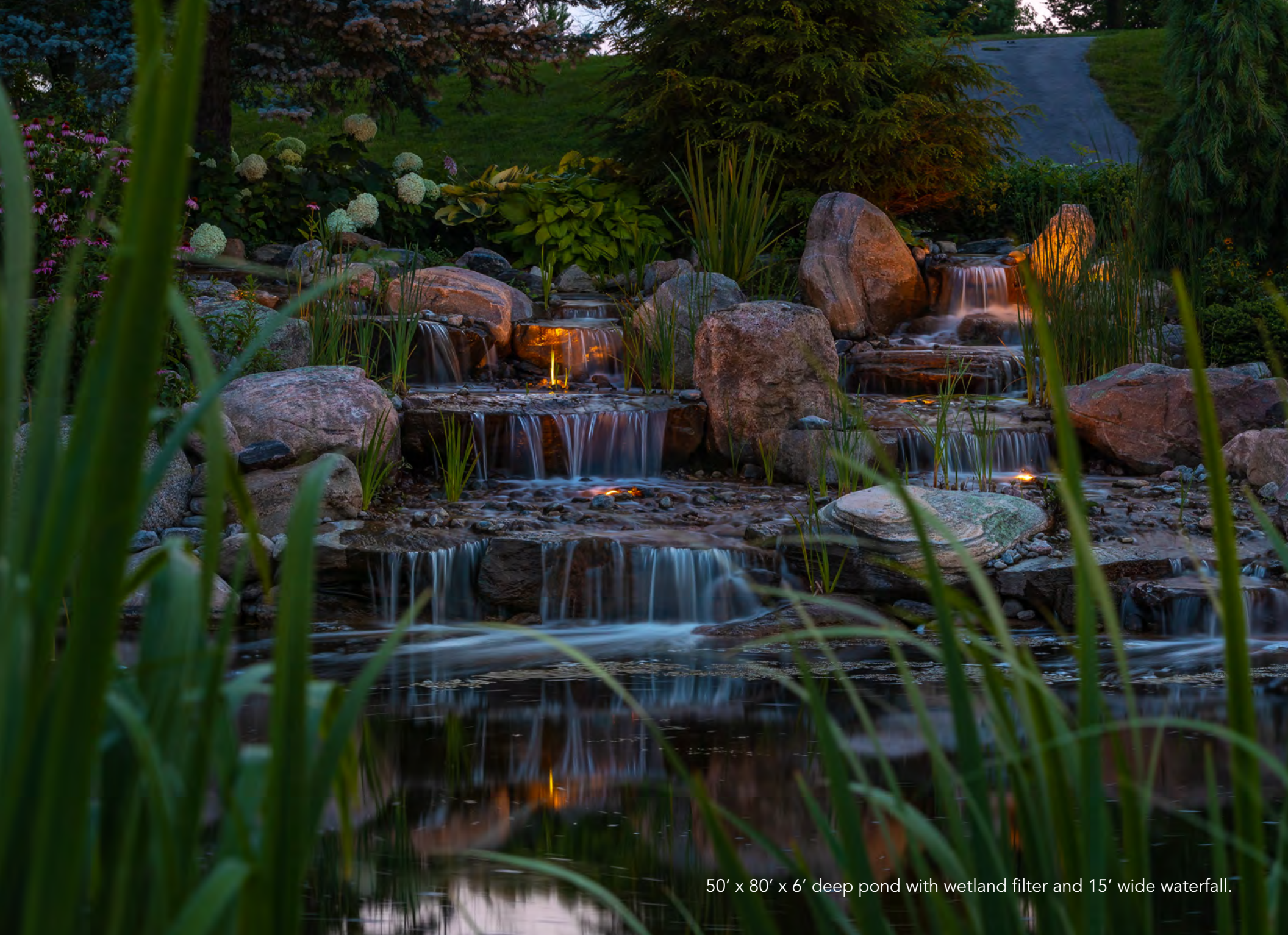
50' x 80' x 6' deep pond with wetland filter and 15' wide waterfall.